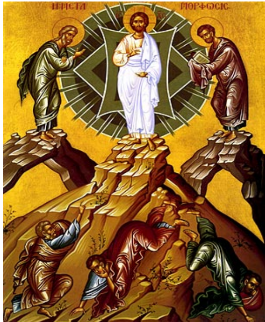
Feast of the Transfiguration of Christ, August 6 th